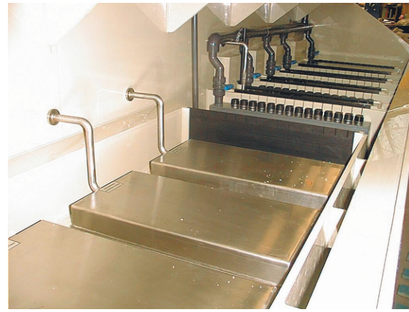
Multi wire degreasing.