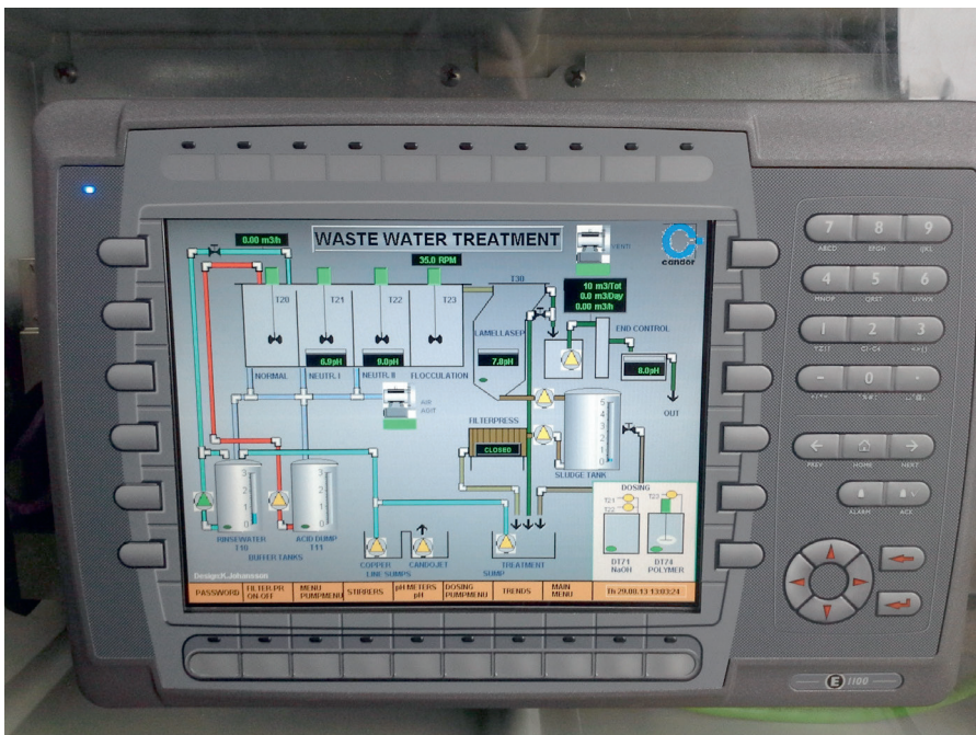
PLC control system.

Candor Sweden AB Box 950, SE 601 19 NORRKÖPING Tel: +46 11-21 75 00 Fax: +46 11-12 63 12 info@candorsweden.com