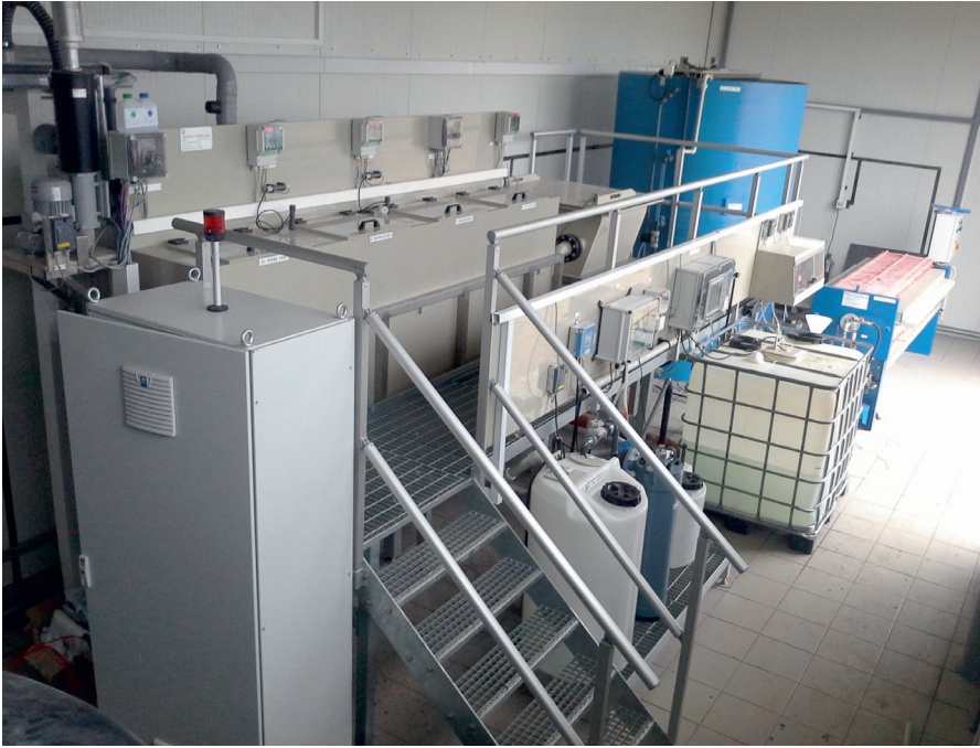
Waste water treatment by neutralization and separation processes.